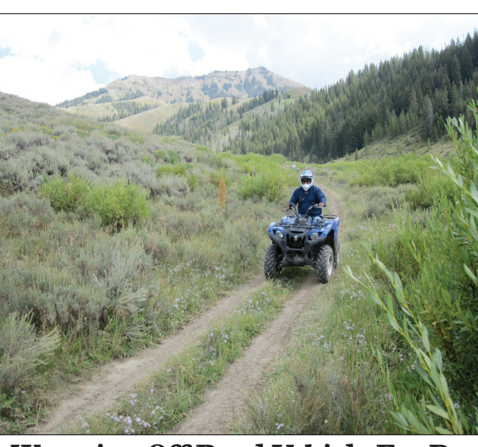
Wyoming Off-Road Vehicle Fee Decals Now Available through Website

The fair is great for everyone of all ages.