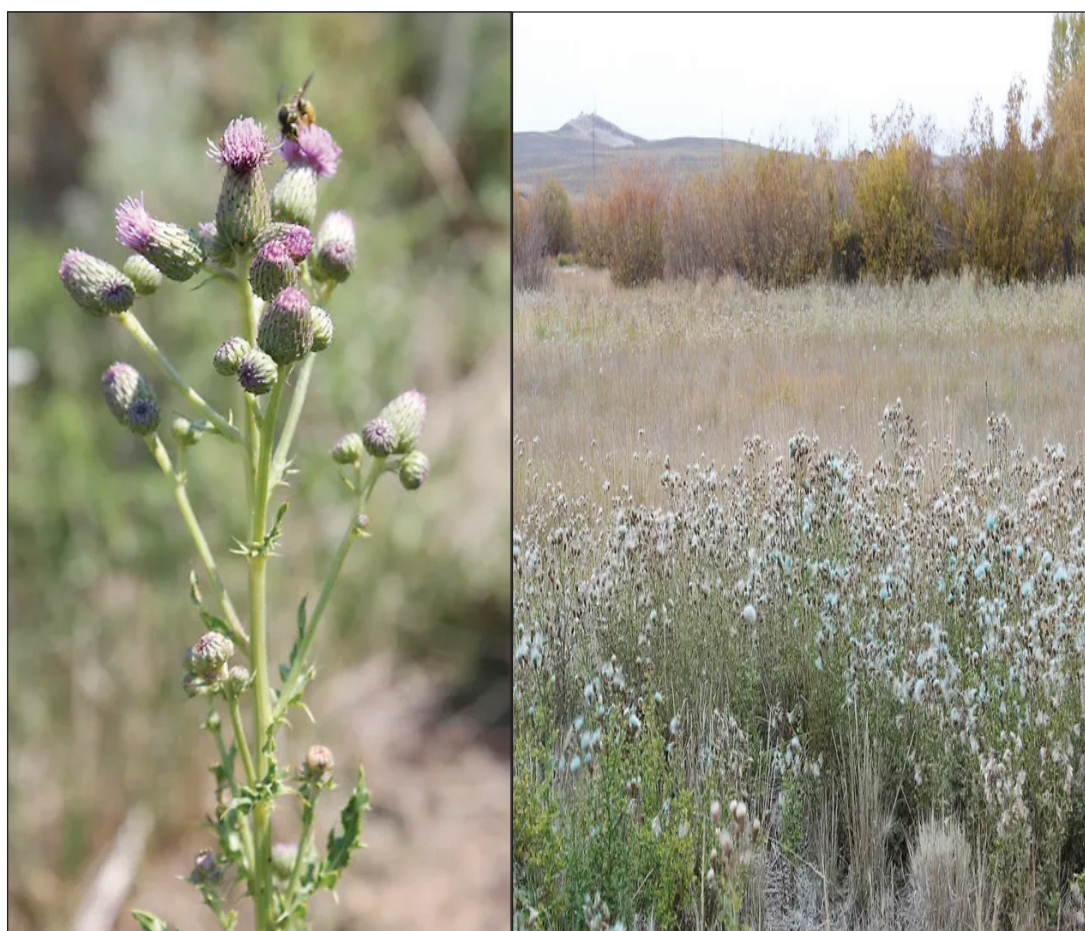
Above: Canada Thistle.